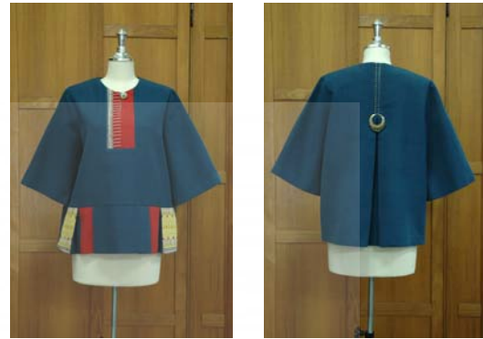
Fig. 1 Blouse pattern A

The research results showed that the development of the design apparel product style from Teen Chok of Mae Chaem district in Chiangmai for the standard local products had 9 patterns. The style of apparel were the casual apparels. The materials are indigo dyed fabric [Lanna fabric]. They were decorated in Teen Chok fabric of Mae Chaem district by these techniques ; the patchworks, the applique, the gathers, the filling, the pockets, the embroideries, the tuck, the binding and the pleating.