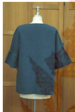
Fig. 5 Blouse pattern E