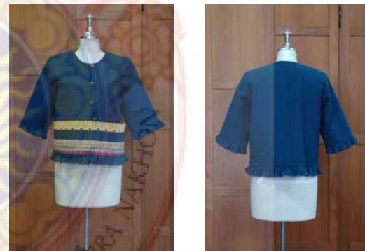
Fig. 3 Blouse pattern C