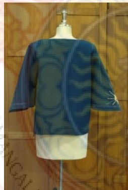
Fig. 6 Blouse pattern F