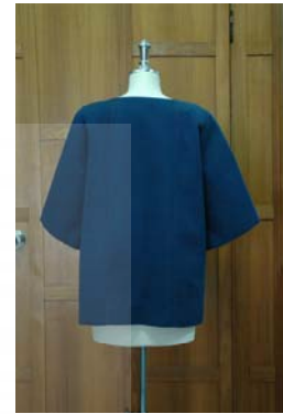
Fig. 7 Blouse pattern G