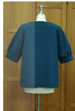
Fig. 8 Blouse pattern H