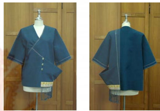
Fig. 2 Blouse pattern B