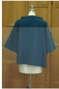
Fig. 4 Blouse pattern D