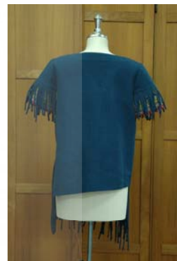
Fig. 9 Blouse pattern I

The assessment reviews of the design apparel product style of interested groups are female, aged 31-40 years, the government officers, income 15,001-20,000 baht and bachelor education.